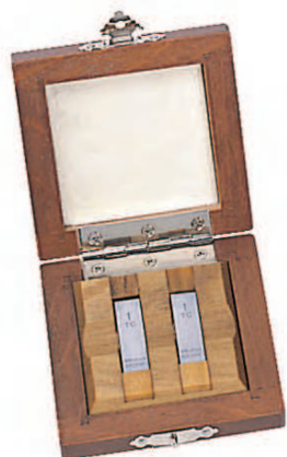
Carbide 2-block set