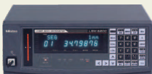
Display Units Pages 422 to 444