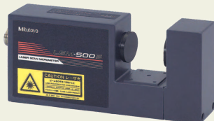
Measuring Units Pages 438 to 440