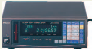
Measuring and Display Unit Package Pages 437