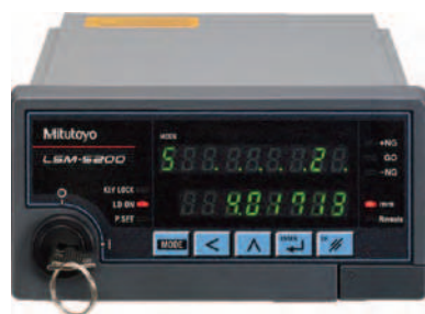
LSM-5200 display unit