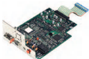
02agp150 - Dual-type add-on unit