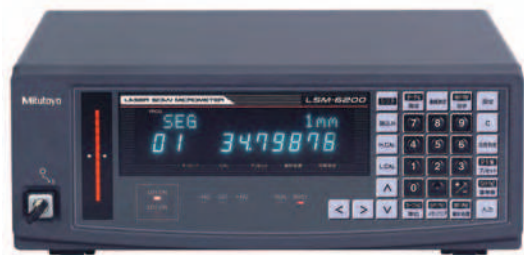
LSM-6200 display unit