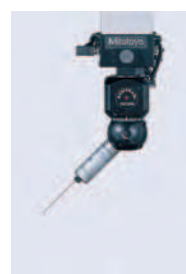
MPP-10 For effective thread- depth measurement