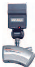
SurfaceMeasure 606 Line laser probe Software : MSURF