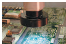
QVP (Quick Vision Probe) For video Measurement Software : VISIONPAK