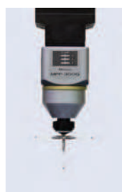
MPP-310Q Ultra-high accuracy and low measuring force type