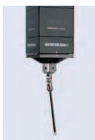
SP80 High accuracy type available with 500 mm extension