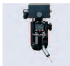
MIH Manual index type