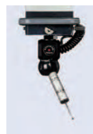
SP25M Compact and high accuracy type