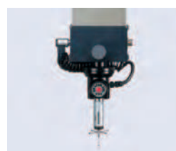
PH1 Simple manual type