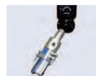
Micro Touch Probe UMAP-CMM