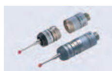
TP20 Compact type