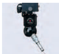
PH10M Motor drive index type