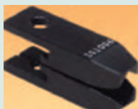
Jaw tip ø4-5