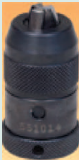
Precision quick chuck