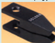
Jaw tip ø1-3