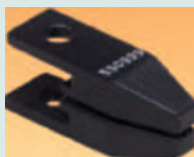
Jaw tip ø0-2