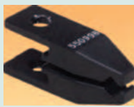
Perpendicular jaw tip