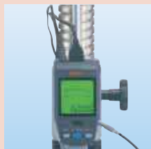
Digimatic Indicator ID-H with 02AZD790D cable