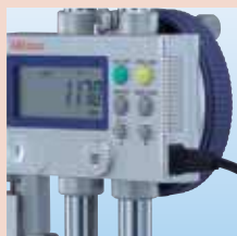
Digimatic Height Gauge with 02AZD790F cable