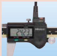
Standard ABSOLUTE Caliper with 02AZD790C cable