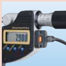
QuantuMike with 02AZD790B cable