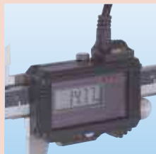
SuperCaliper with 02AZD790A cable