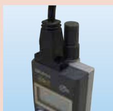
ABSOLUTE Digimatic Indicator ID-N with 02AZD790G cable