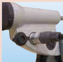
Quick Micrometer with 02AZD790E cable