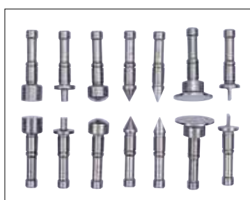
Interchangeable contact points (optional)